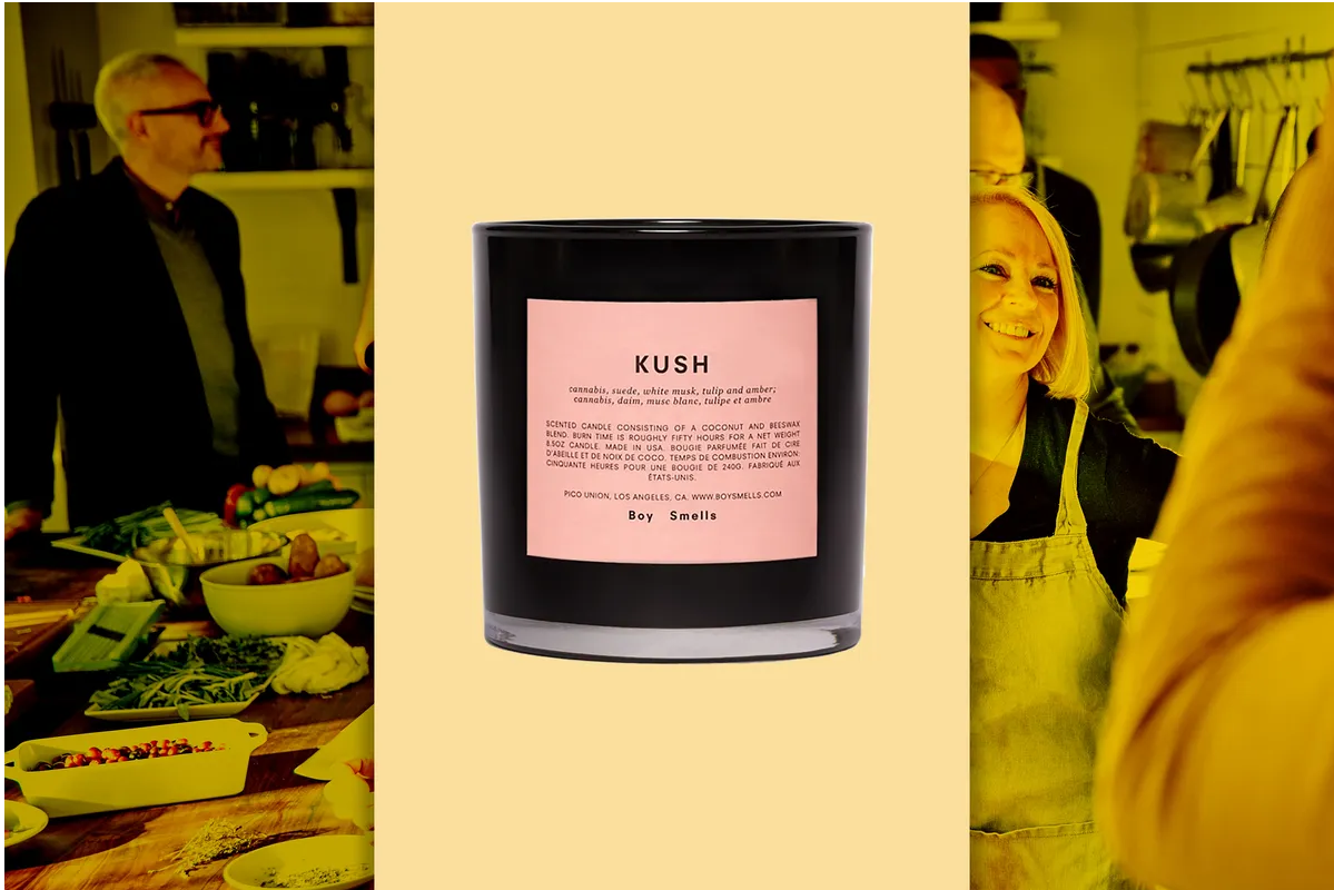
Boy Smells' Kush Scented Candle.

Every product is independently selected by editors. If you buy something through our links, New York may earn an affiliate commission.